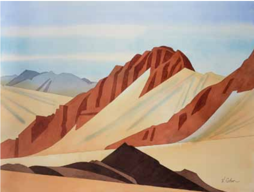
“Volcanic Death Valley,” Watercolor, 22”x 30”