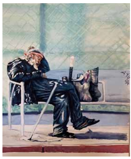
Figures and Portraits 1st Place "Down and Out" by Kathryn Dudley