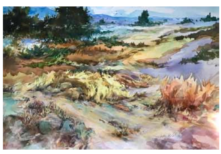
Landscapes and Architecture 1st Place "Up The Hill" by Judy Welsh