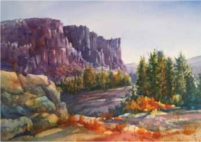
Watercolor of Emigrant Gap by Kay Tietz