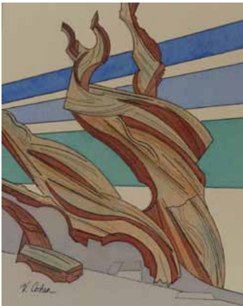
Above: "Ready For Takeoff"

Will hold their first show at the May Museum which is reopening July 1. "America The Beautiful" will be up from July 1-31.