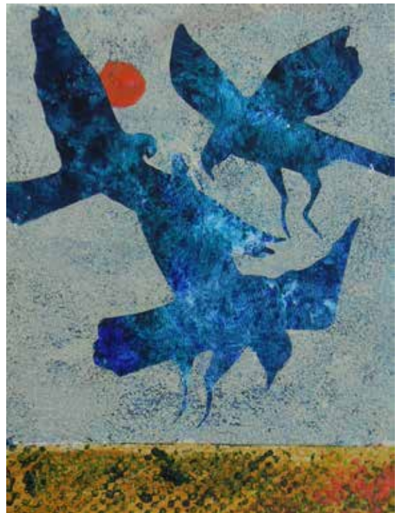
Birds In Flight by Tricia Leonard