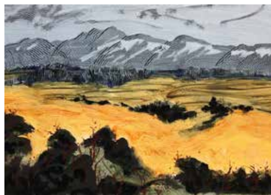
3rd Place: “East Of The Sierras” by Lynn Schmidt