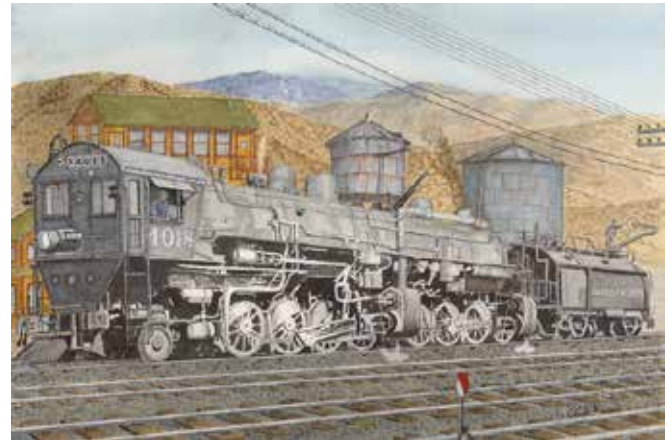
Best of Show 2020 Annual Judged Exhibit "Variations On A Theme" "Cab Forward - Sparks" by Reid Sewell

Email USAartists@hahnemuehle.com and mention SIERRA WATERCOLOR SOCIETY. Include your shipping address.