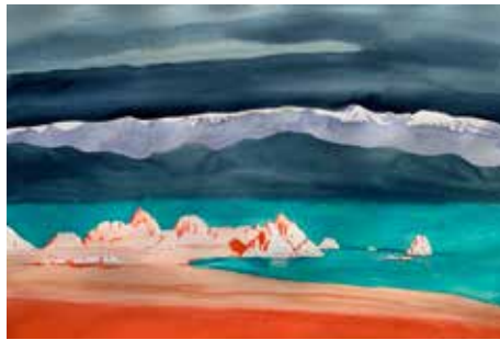
Tied for 3rd Place: Laurel Sweigart's untitled orange and blue coastal image