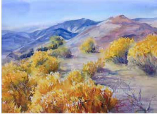
"Rabbit Brush Run", watercolor by Colleen Reynolds