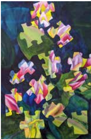
1st Place: Anette Rink's "Rhododendron Puzzle"