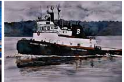
These three paintings tied for Second Place