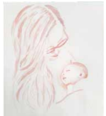
3rd Place Tie - Elizaeth Barile