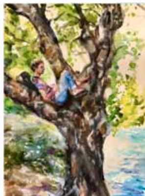
2nd Place - Wendy Winkler