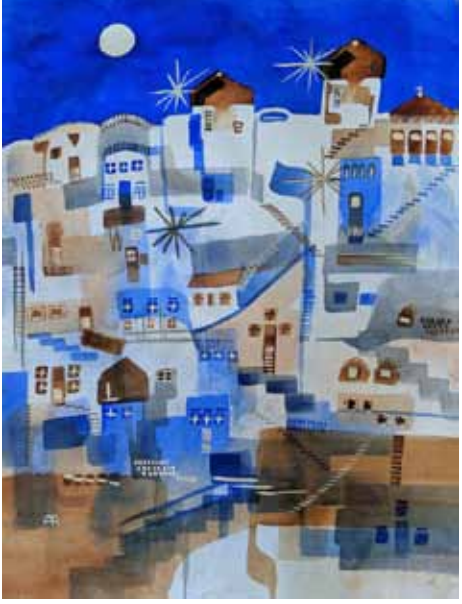
Santorini