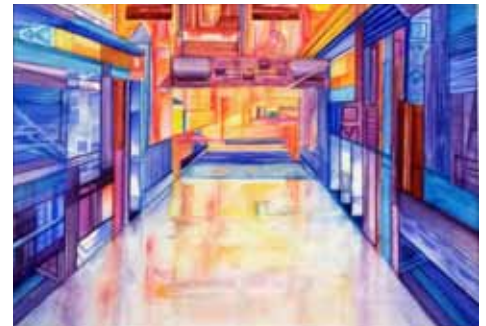
3rd Place - Michelle Hall