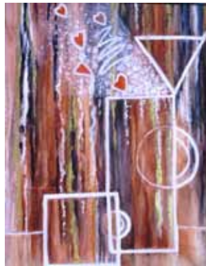
2nd Place - Judy Berland