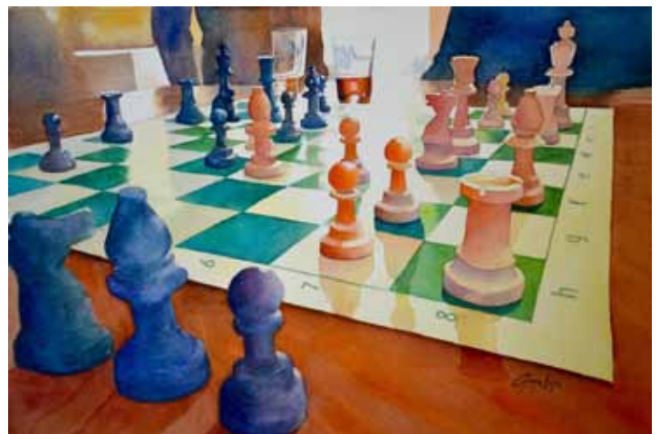
"Spectators" by Gina Lijoi

See more paintings accepted into WASH Go With The Flow on pages 2, 7, and 8.